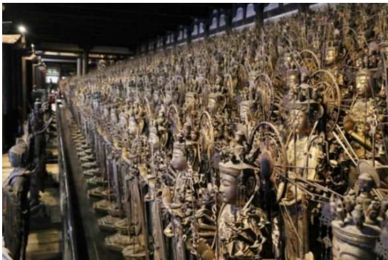
Tausend Bodhisattvas, Renge-Ō-in, Kyoto

„KoPhil-Gastlink“ (Produktion: IT-Support, Institut für Philosophie /Universität Wien) https://moodle.univie.ac.at/mod/bigbluebuttonbn/guest.php?uid=da08857845041134a96130eccdc90f59f9bc4a822 Pass Code: OrTKsP5i